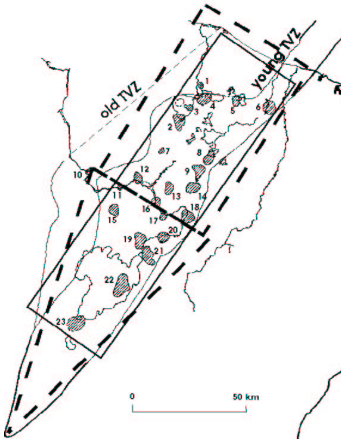
Figure 1. Area estimates for the TVZ. The shaded and labelled areas are the geothermal fields: 1.Taheke, 2.Rotorua, 3.East Rotorua, 4.Rotoiti, 5.Rotoma, 6.Kawerau, 7.Horohoro, 8.Waimangu, 9.Waiotapu-Waikite, 10.Mangakino, 11.Ongaroto, 12.Atiamuri, 13.Te Kopia, 14.Reporoa, 15.Mokai, 16.Orakeikorako, 17.Ngatamariki, 18.Ohaaki, 19.Wairakei, 20.Rotokawa, 21.Tauhara, 22.Lake Taupo, 23.Tokaanu.

the special properties of the TVZ (see Weir, 1998a). The large scale physics of the TVZ have been summarised by McNabb (1975).